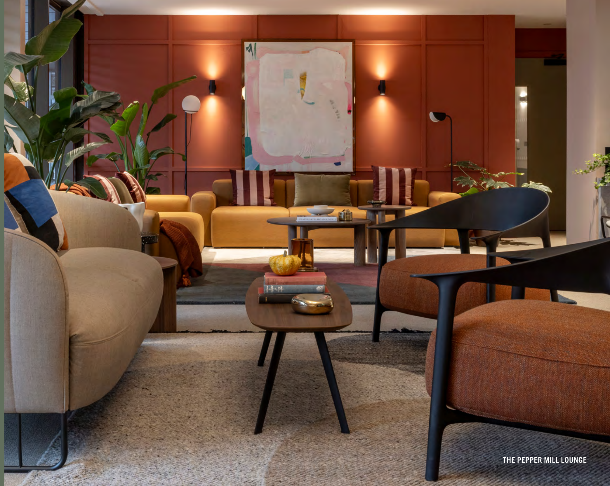
THE PEPPER MILL LOUNGE

At The Pepper Mill, we redefine student living with unmatched comfort, sophisticated design and a thriving sense of community.